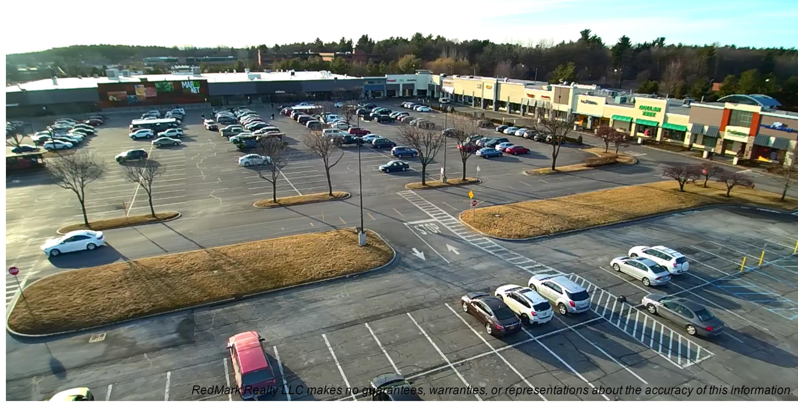
RedMark Realty LLC makes no guarantees, warranties, or representations about the accuracy of this information.