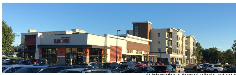
this information is deemed reliable, but not guaranteed.

Logos are for identification purposes only and may be trademarks of their respective companies.