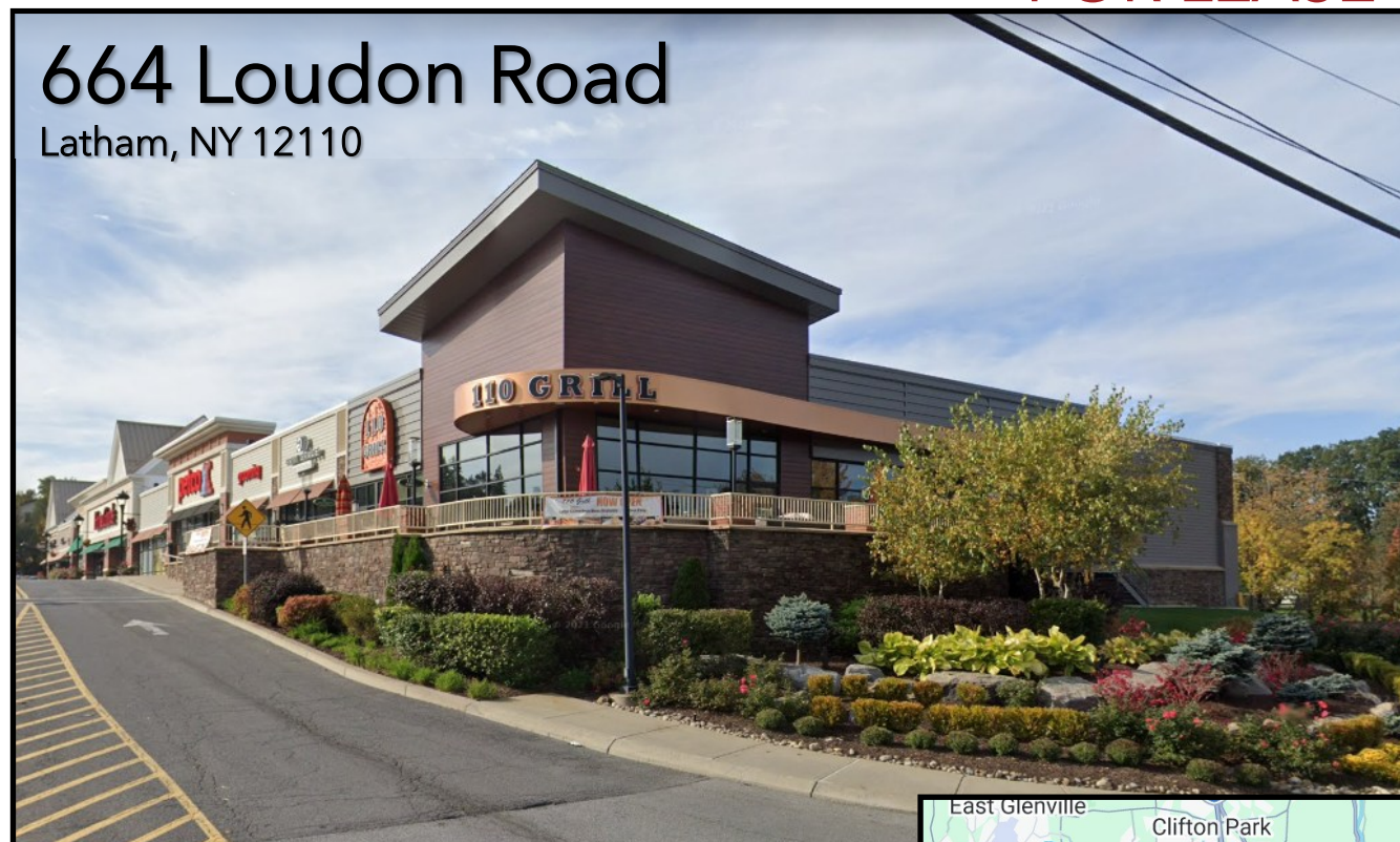
Turnkey restaurant space located along high-traffic retail corridor in Latham.